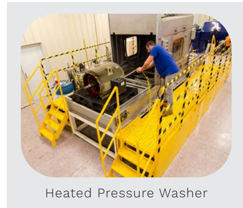
Heated Pressure Washer