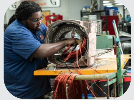
Full Motor Rebuilds / Rewinds