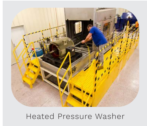
Heated Pressure Washer