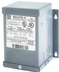
Style A—Type 3R Rated