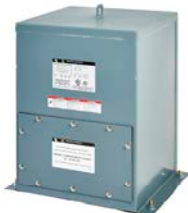
Style X—Type 4X Rated