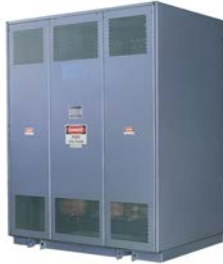
Style F—NEMA 1 Rated