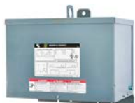
Style C—Type 3R Rated