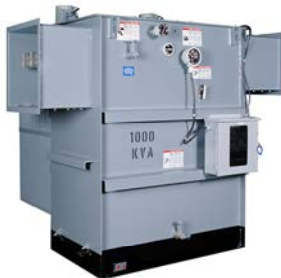
Liquid Filled Substation