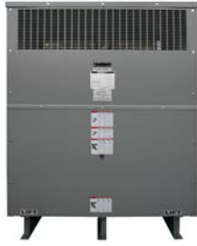
Style D, NEMA 1 Rated