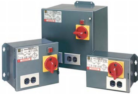
Transformer disconnects are available in NEMA Type 1 Standard, NEMA Type 12 Standard, and NEMA Type 1 Mini.

Square D™ brand transformer disconnects mount inside or outside a control system enclosure. The transformer disconnect being connected directly to the 480 Vac system controls power for auxiliary, single-phase loads when the main three-phase disconnect is either ON or OFF. The transformer disconnect is normally wired to the line side of the control panel's main disconnect.