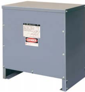
Style E—IP55 Rated

These dimensions are not for construction. Contact your local Schneider Electric representative for certified prints.