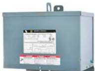
Style C—Type 3R Rated