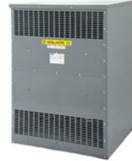
Style J—Type 1 Rated Converts to Type 2 with Drip Shield Converts to Type 3R with Weathershield