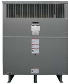
Style D, NEMA 1 Rated