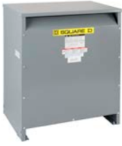
Style D and H—Type 2 Rated Converts to Type 3R with Weathershield