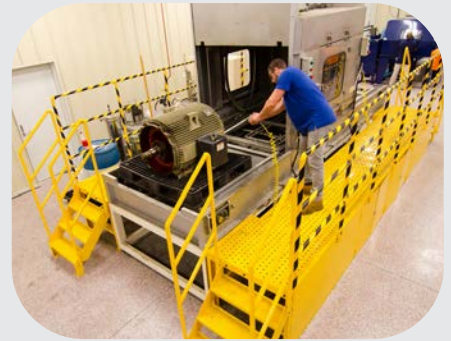
Heated Pressure Washer