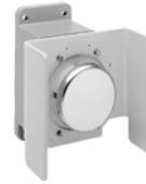
Palm-Operated Surface Mount with Guard Cat. No. 800P-S2CG1A