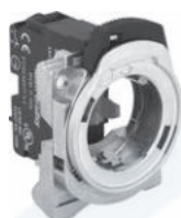
Metal Latch with Contact Block