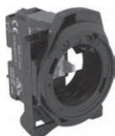
Plastic Latch with Contact Block