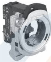
Metal Latch with Contact Block