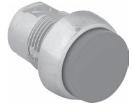
Bul. 800FM Die-Cast Metal Operators