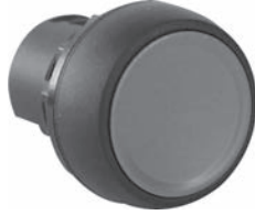
Bul. 800FP Plastic Operators