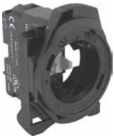
Plastic Latch with Contact Block