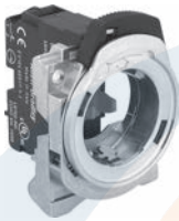
Metal Latch with Contact Block