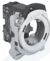
Metal Latch with Contact Block