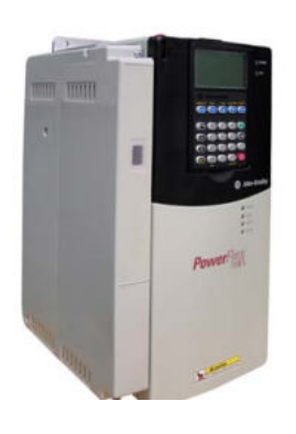
PowerFlex 700S AC Drive with Expanded Cassette