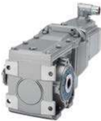
Bevel geared motor