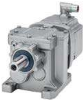
Helical geared motor