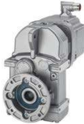
Parallel shaft geared motor