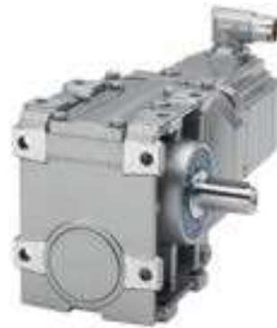
Helical worm geared motor