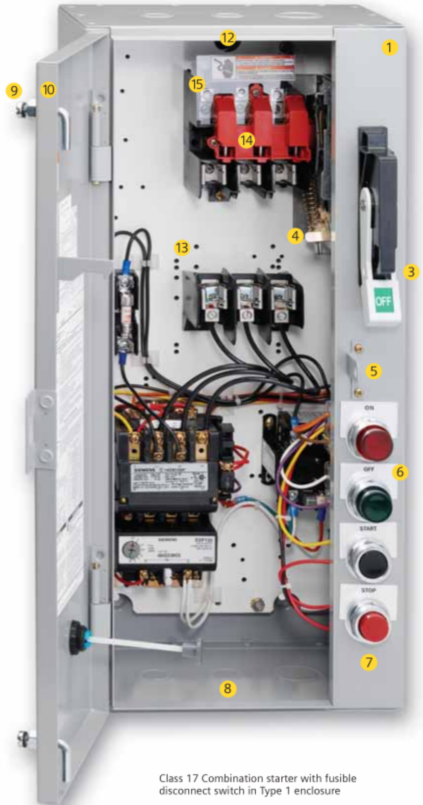
Class 17 Combination starter with fusible disconnect switch in Type 1 enclosure