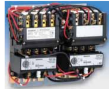
Two-Speed Non-Combination: Class 30 Combination: Class 32