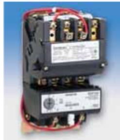
Non-Reversing Non-Combination: Class 14 Combination: Class 17, 18

Siemens manufactures a broad range of starters designed to meet all of your most demanding applications. Included in our line of NEMA starters are full and reduced voltage starters, reversing and non-reversing starters as well as two-speed starters. Starter sizes range from 00 to 8 including Siemens exclusive motor-matched half-sizes which saves you money and space.