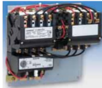
Reversing Non-Combination: Class 22 Combination: Class 25, 26